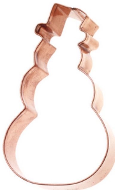
Yasu + Junko

For cookie decorating ideas using these products, see the finished cookies and watch the how-to videos .